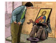
Gospel: Matthew 25:31-46

9 Am I not free? Am I not an apostle? Have I not seen Jesus our Lord? Are not you my workmanship in the Lord? 2 If to others I am not an apostle, at least I am to you; for you are the seal of my apostleship in the Lord.