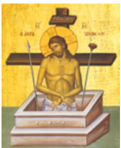
Icon of Christ's Extreme Humility