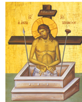
Icon of Christ's Extreme Humility