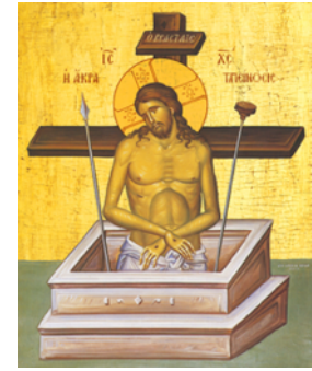
Icon of Christ's Extreme Humility