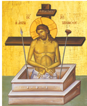
Icon of Christ's Extreme Humility