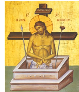
Icon of Christ's Extreme Humility