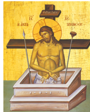
Icon of Christ's Extreme Humility