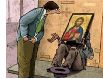
Gospel: Matthew 25:31-46

9 Am I not free? Am I not an apostle? Have I not seen Jesus our Lord? Are not you my workmanship in the Lord? 2 If to others I am not an apostle, at least I am to you; for you are the seal of my apostleship in the Lord.