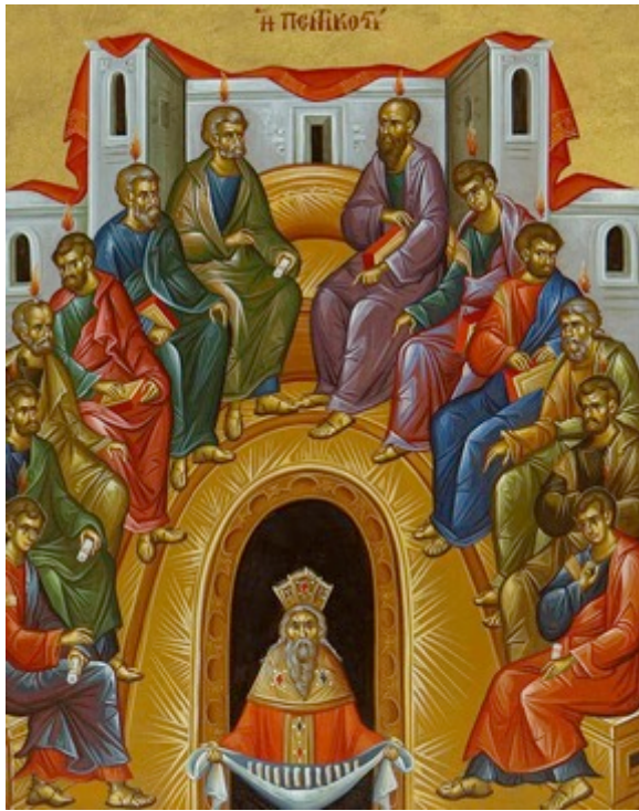
+++ +++ +++ Icon of the Feast

The icon of the Feast of Pentecost is known as "The Descent of the Holy Spirit". It is an icon of bold colors of red and gold signifying that this is a great event. The movement of the icon is from the top to the bottom. At the top of the icon is a semicircle with rays coming from it. The rays are pointing toward the Apostles, and the tongues of fire are seen descending upon each one of them signifying the descent of the Holy Spirit.